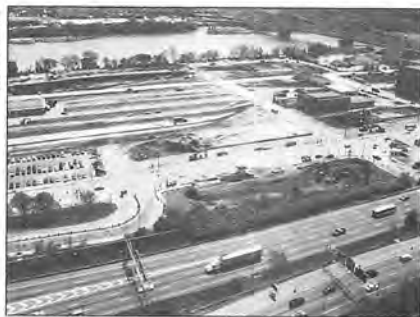
This is how the stadium site looked on May 1, 1998 — one week after groundbreaking.