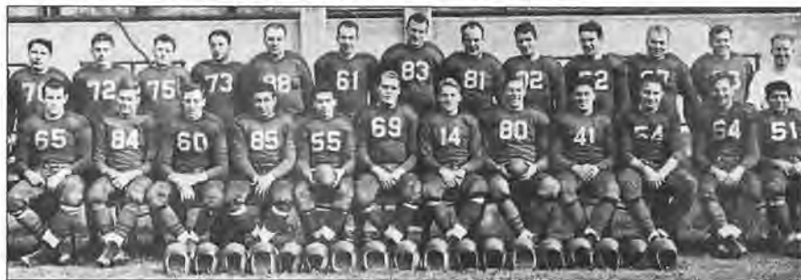
1938 Cincinnati Bengals

The Bengals began play in the AFL in 1968. The AFL merged with the NFL in 1970, and the Bengals have been members ever since.